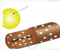
Repair effect is fixed inside the hair and lasts