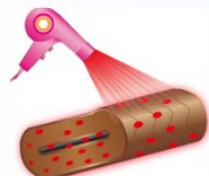
Heat treatment causes bonding with internal hair components